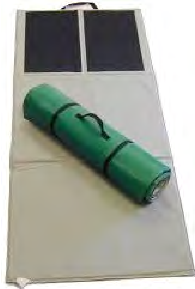
Creedmoor Shooting Mat